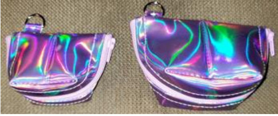
Small Pouch, Larger Pouch