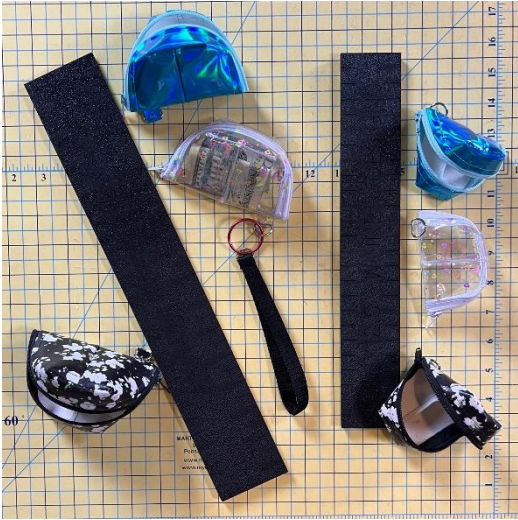
2.5" x 15.5" Ruler