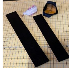
2" x 15.5" Ruler; 2" x 12.5" Ruler