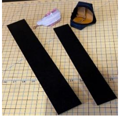
Tiny Pouch Rulers

For the larger 2.5" x 15.5" Pouch, cut your zipper to 16.5" long.