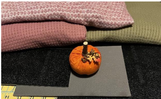
So many fabric choices – here are just a few: Wool Fabrics, several Sweater options