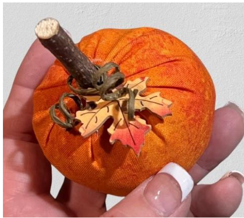
Check out those great embellishment!