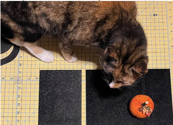
Of Course, Monkey had to check it out!