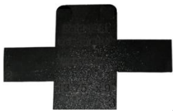
Template with Rounded Corners