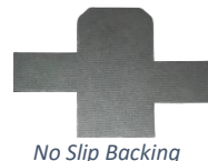
No Slip Backing

Or... cut outer fabric from template then use Rectangle Base Template to cut lining fabric – this makes the cutting & sewing faster!