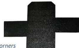
Template with Angled Corners

Using Winner Designs Fold 1 2 3 Card Wallet Template , this fun little wallet is quick & easy to make!